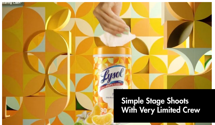
Simple Stage Shoots With Very Limited Crew