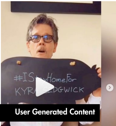
User Generated Content