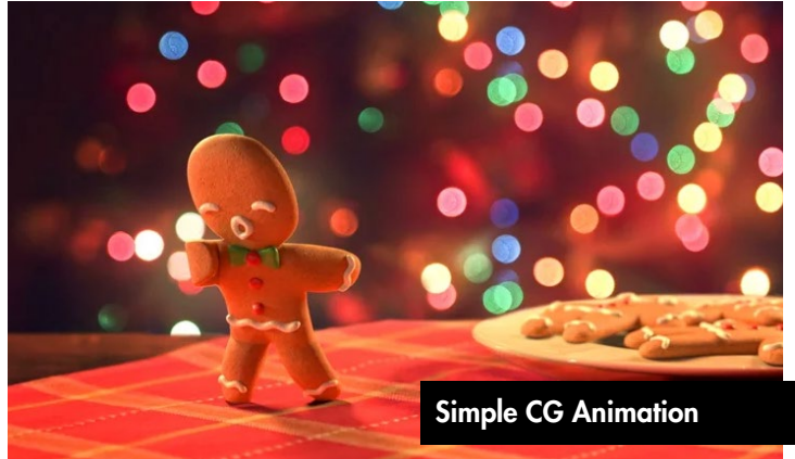
Simple CG Animation